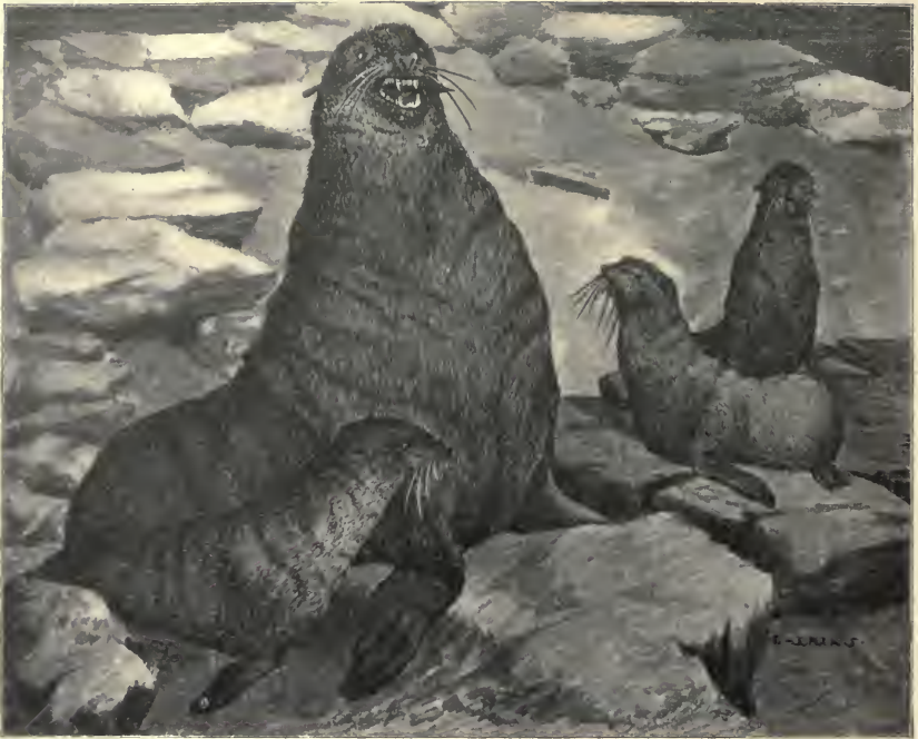
FIG. LX. GROUP OF FUR SEALS OR SEA-BEARS.